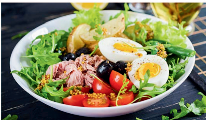
Caesar Salad with Dressing